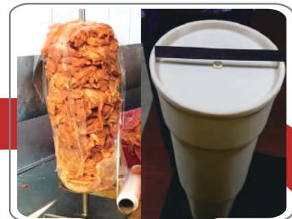
Manual Stacking / Forming or Reforming in mold