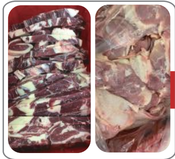
Meat Preparation & Marinating Beef, Chicken, Lamb, Turkey, etc.