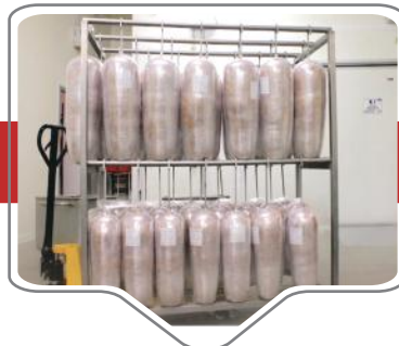
Storing & Keep Frozen